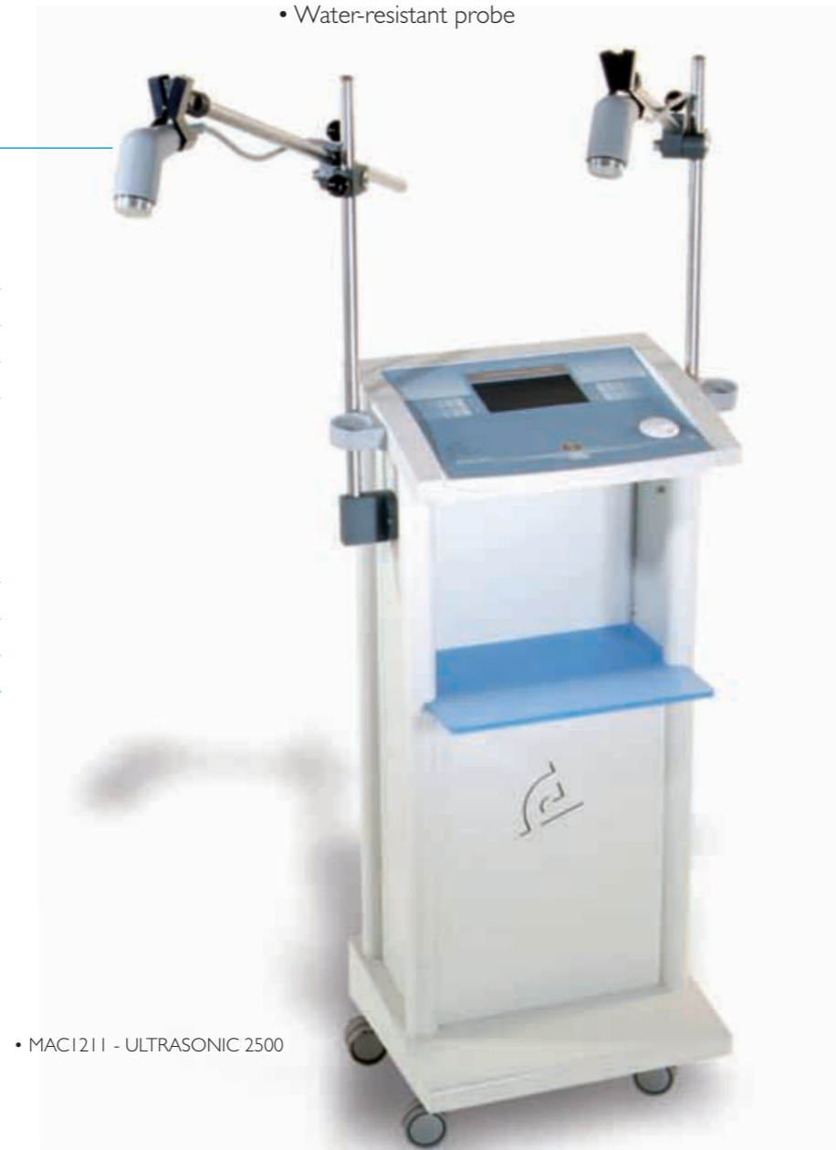
• MAC1211 - ULTRASONIC 2500