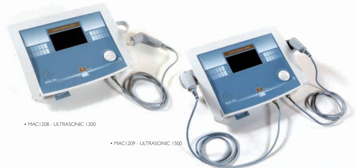
• MAC 1208 - ULTRASONIC 1300