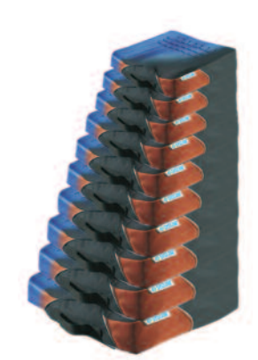
AVAILABLE IN 10 DIFFERENTS SIZES

→ Avoiding any sliding of the cushion from the support (POLYMAILLE® only).